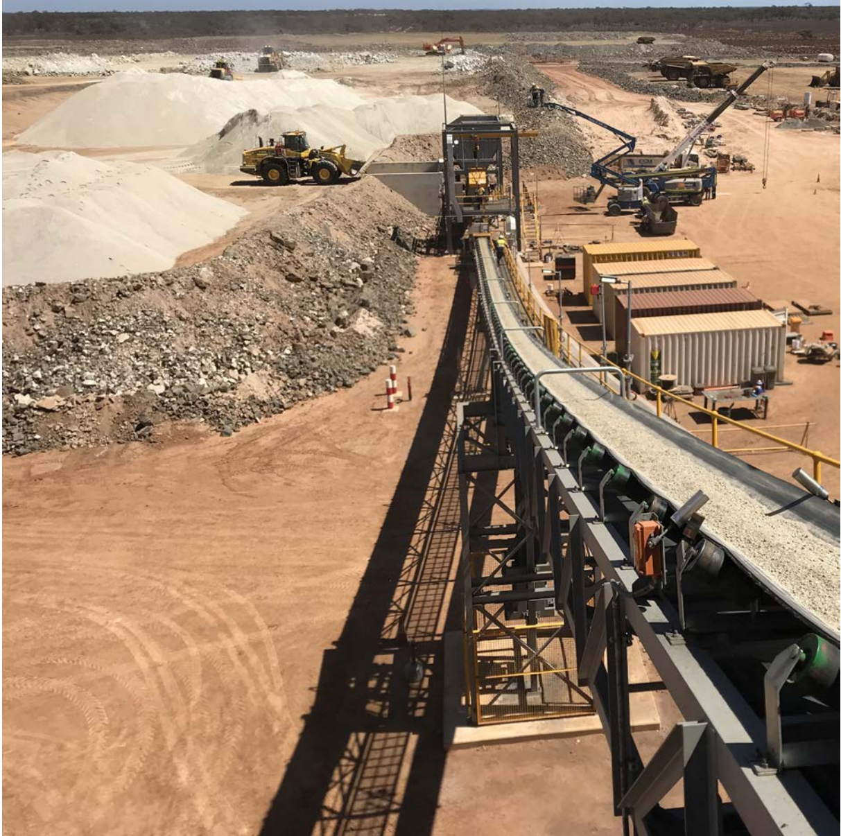
Figure 1 | Ore Feed