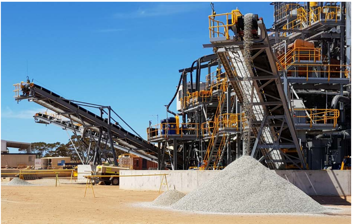
Figure 4 | Stockpiles