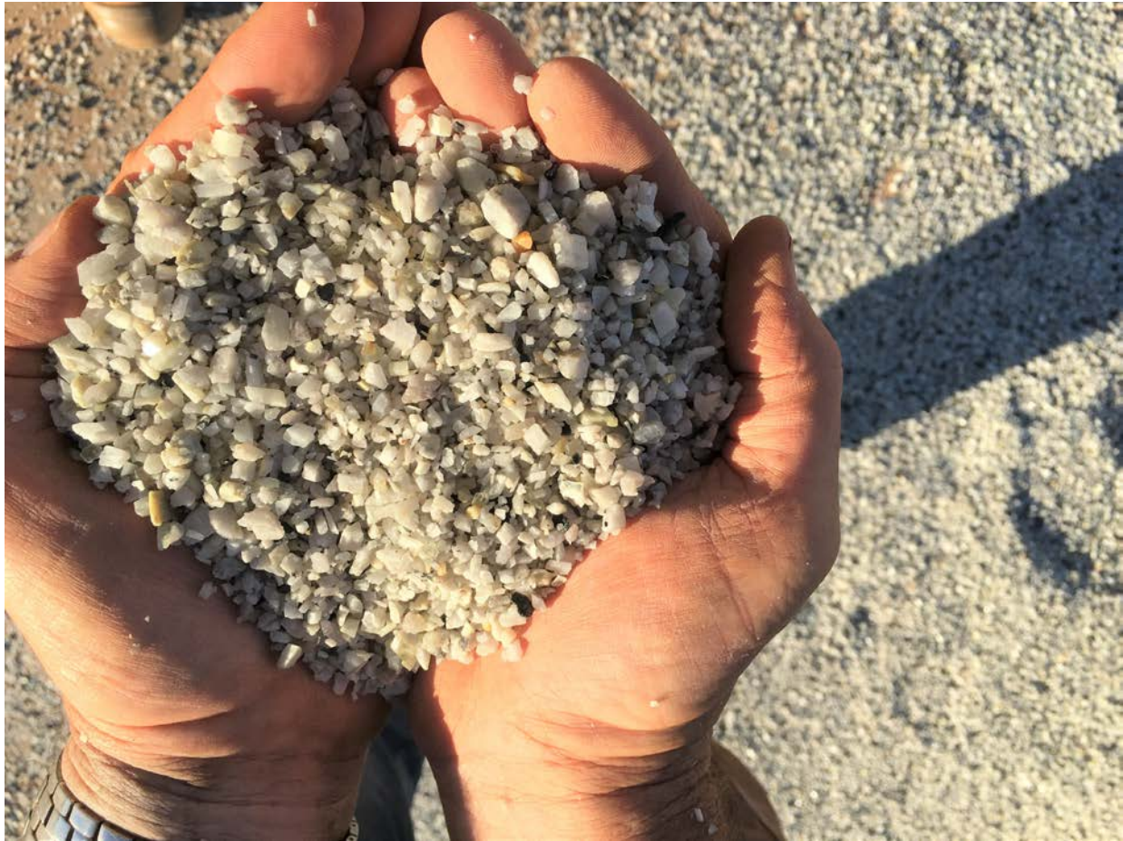
Figure 5 | Spodumene concentrate